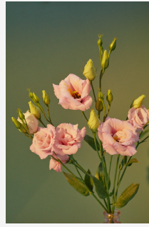
Brett Mulock Bldg. & Grounds