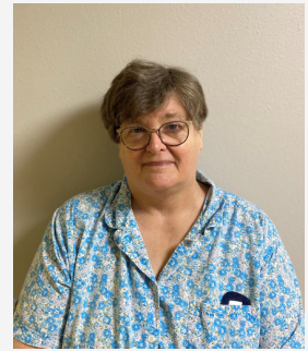
Diane Meyer Fellowship